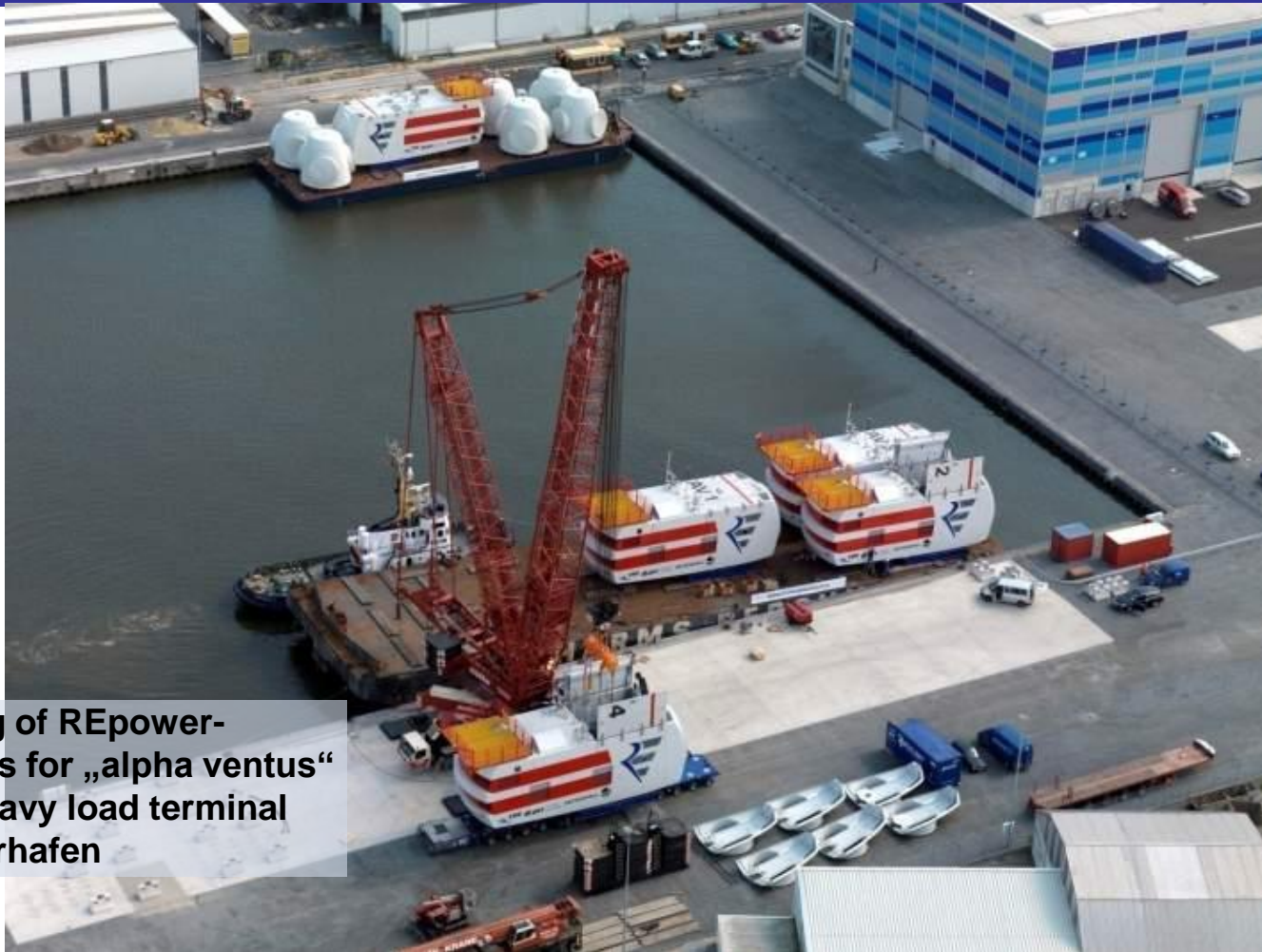
Handling of REpower-machines for „alpha ventus“ at the heavy load terminal Labradorhafen